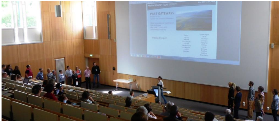
Poster presenters lining up for their athletic 1-minute poster presentation.

All poster presenters had the unique chance to present their poster prior the poster session in the auditorium. Altogether 27 one-slide contributions were received and presented in one minute. We received very positive feedback by the poster presenters as well as by listening participants who were able to get a quick overview on topics presented during the poster session.