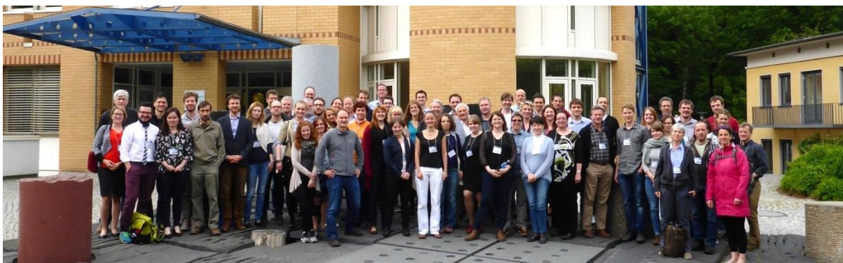
Participants of the PAST Gateways conference and workshop held in Potsdam, 18-22 May 2015