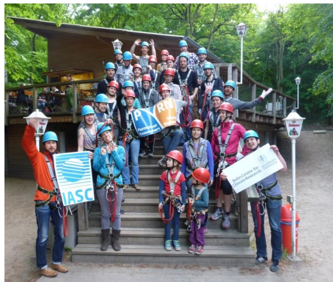
Support for ECR was highly appreciated!

The PAST Gateways 2015 local organizing committee, participants and especially the participating Early Career researchers are grateful for generous support by the International Arctic Science Committee (IASC) and the Bolin Centre for Climate Research at University Stockholm which enabled to greatly reduce the registration fee for ECR. Further support was given by the German Science Foundation (DFG), International Permafrost Association (IPA), as well as the ThermoScientific, Picarro Inc. and BetaAnalytics.